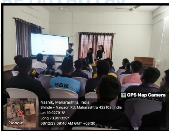
Students While Attending CPR NBEMS Awareness Programme